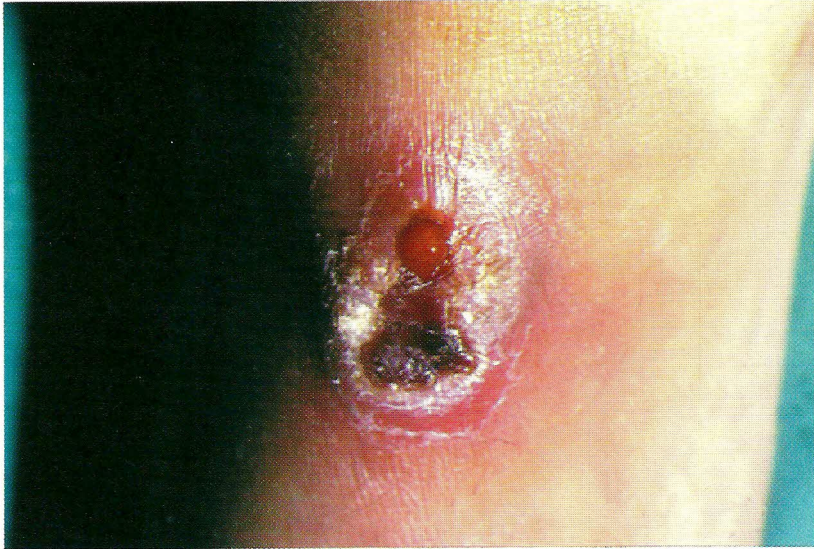
Fig. 3. Necrotizing folliculitis.

fluent, much more numerous, unresponsive to usual treatment, and may appear in unusual places (Fig. 1).