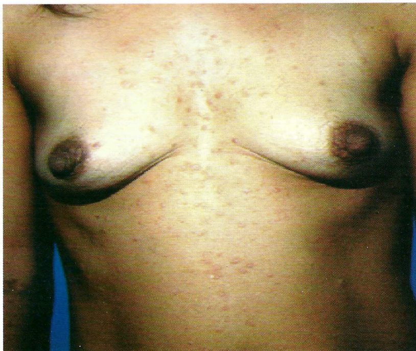
Fig.4. Papular pruritic eruption.

interferon-alpha are also standard measures used for HPV infection (7). Recently new topics, such as imiquimod or 3% cidofovir ointment, have been successfully used.