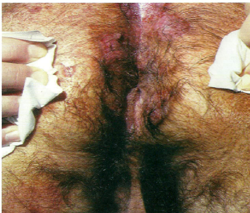
Fig. 6. Perianal prurigo.

The treatment is complicated because to the topical antiseptics we have to add antivirals like valaciclovir, metronidazole or penicillin depending on the gravity and the etiology.