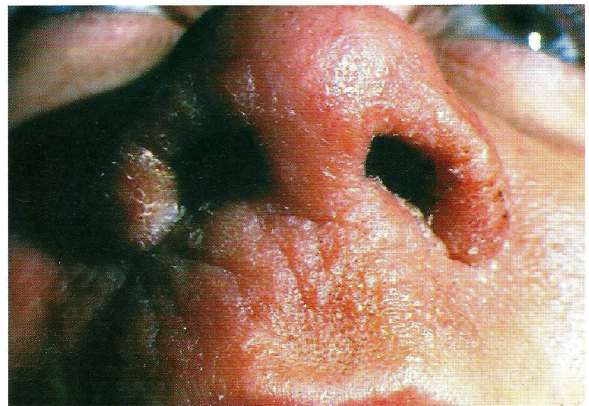
Fig.2. Cutaneous leishmaniasis nasal aria.

The clinical patterns that can be seen comprehend all the spectra known. In the early HIV disease, the clinical manifestations, clinical course and response to treatment are not unusual. With moderate or advanced immunodeficiency, the HPV lesions may become con-